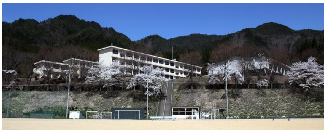
School buildings seen from the school field

HP: http://school.gifu-net.ed.jp/yosiki-hs/