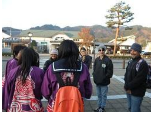
The number of visitors from other countries has been increasing recently.