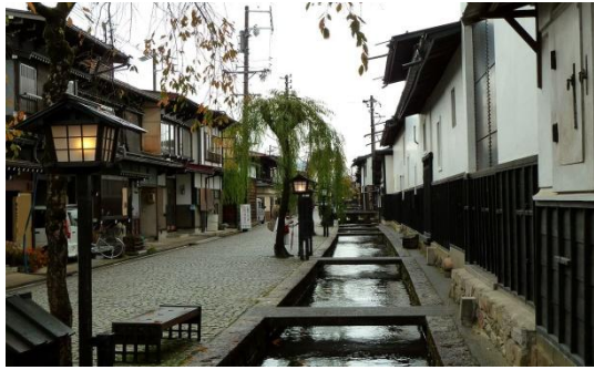
The Historical District of Furukawa In summer, you can see beautiful carp swimming in a canal.