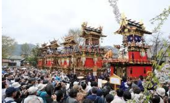
Furukawa Festival in the daytime: beautiful festival floats marching through the town