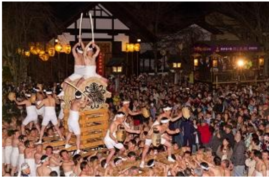
Furukawa Festival at night: an energetic Okoshi Daiko ( large Japanese drum) parade