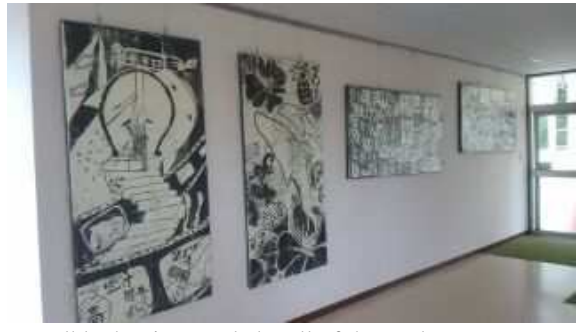
Woodblock prints made by all of the students at an annual school event "Woodblock Print Contest." You can see their excellent works in the hallways.