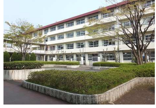
Courtyard, which has an open-air stage for school events