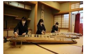
Koto music Club