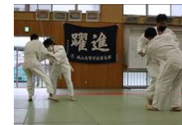
Judo Club (Throwing Technique)