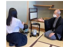
Tea ceremony and flower arrangement Club