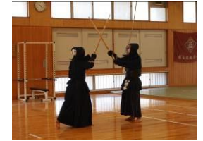
Kendo Club (Sword Technique)