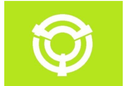
[Flag of Seki city]