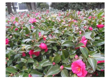
Winter camellia in bloom with its buds in January