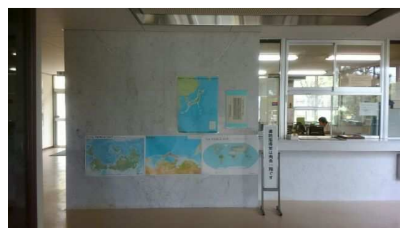
School office and visitors' reception across the entrance