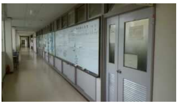
A corridor in front of a teachers' room