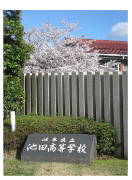
Stone monument and cherry blossoms by main gate

Ikeda High School has an extensive campus of 41,261 square meters with several useful facilities. Some of these facilities include two four-story school buildings, a gymnasium, a martial arts hall, a physical training and shower room, tennis courts, a baseball field, a soccer ground, and a track and field ground.