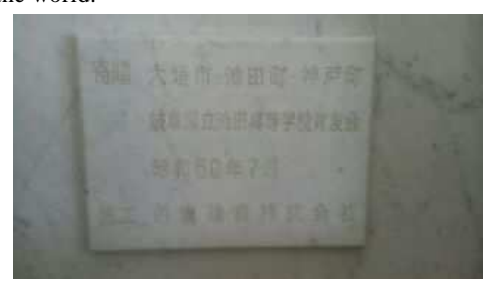
A marble plate stating the mosaic was presented to Ikeda High School by Ogaki, Ikeda and Godo in July, 1985.