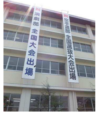
Cheering banners for the drama club and the Karate club that had won each prefectural tournament and would take part in the All Japan High School Championship