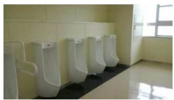
Renewed bathrooms with combination toilets and bidet