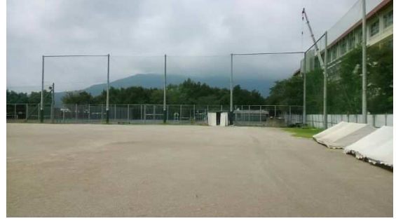
Main ground in the foreground and the second tennis field in the back