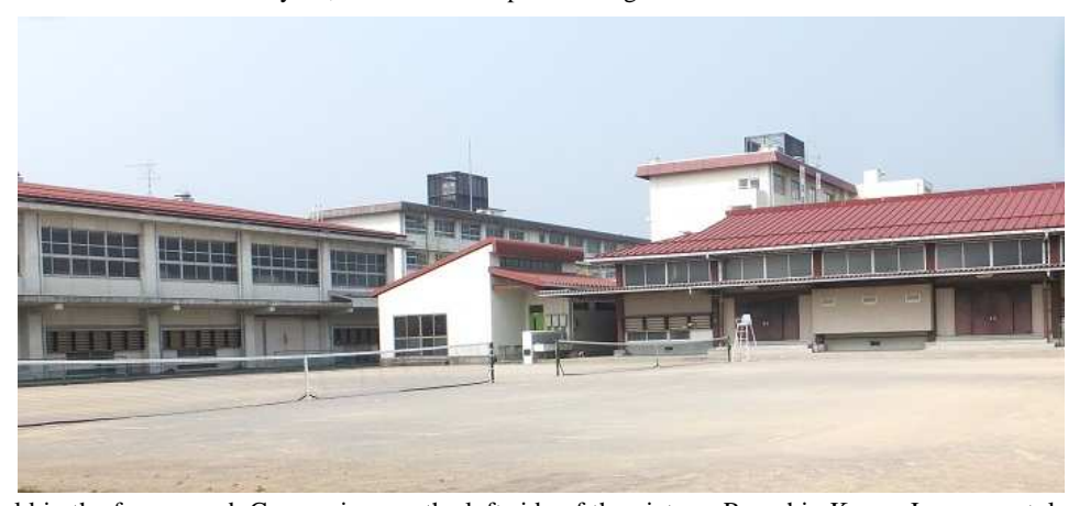
Tennis field in the foreground, Gymnasium on the left side of the picture, Ren-shin Kan, a Japanese-style gymnasium for martial arts on the right side of the picture