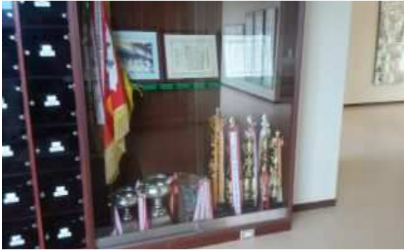
The former championship flags and trophies surrounding the entrance